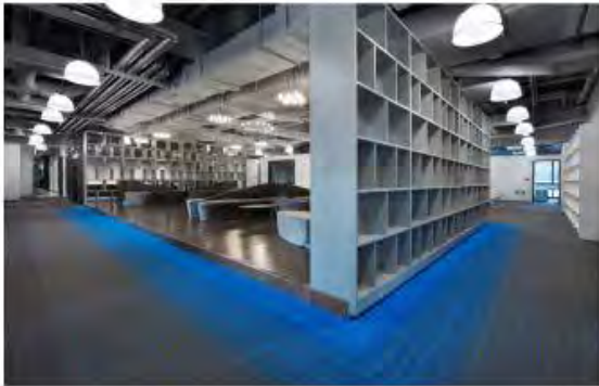
PVC-backed carpet tiles: PVC carpet tile, SDN 6 PVC carpet tile, SDN6.6